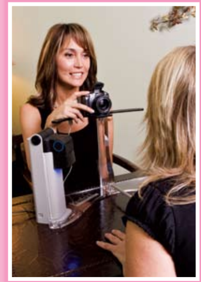
Cascades MedSpa patients can expect excellence from a professional staff who provide a comfortable atmosphere for all procedures from beginning to end. (above) A patient receives her initial consultation and infrared photo before IPL Facial Rejuvenation while (below) another patient relaxes during a laser hair removal session.